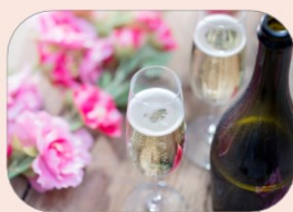
Complimentary glass of Prosecco or Buck's Fizz